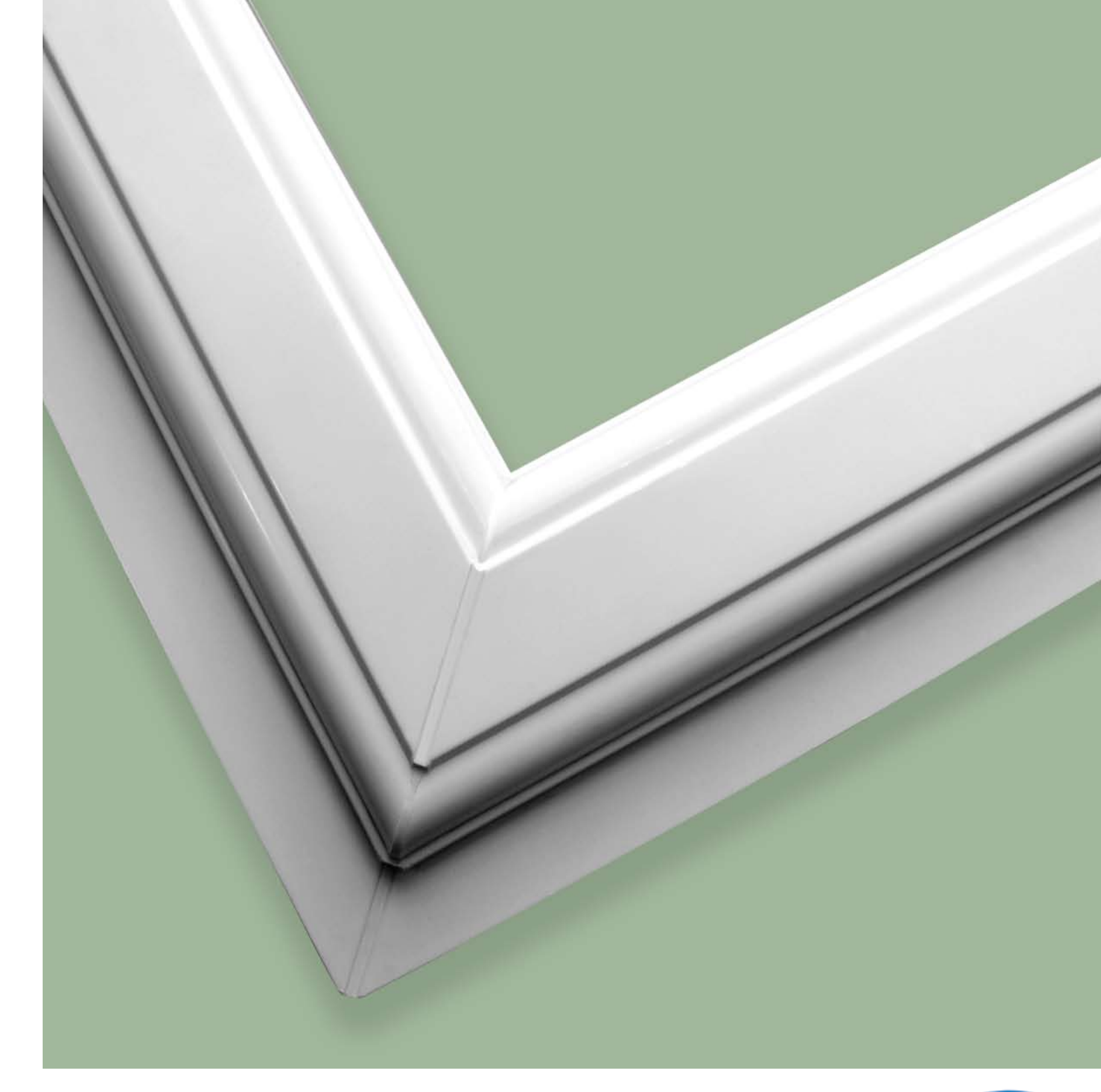
Fully integrated PVCu system - features and benefits

marketingdep@whs-halo.co.uk www.whs-halo.co.uk